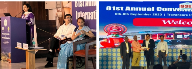
Presentation and Certificate of participation being presented to the author during 81st STAI Annual Convention 2023

Keeping in view the significance of the event and the limited number of technical papers to be accepted and presented during the convention, the authors are requested to write quality papers, giving their latest innovations, enclosing the precise data with the achievements of their research work and its usefulness to the sugar industry. The last date for submission of soft copy of the paper is 10th June 2024. Detailed guidelines can be accessed from STAI website.