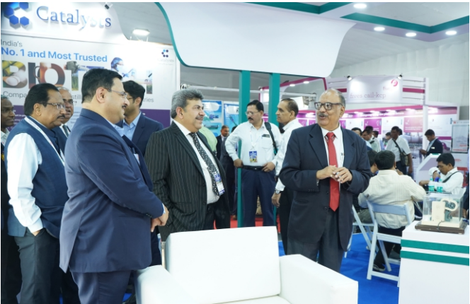
Snapshot of the International Sugar Expo 2023

International Sugar Expo 2024 will be held concurrently along with the Convention at the state-of-the-art facility at Jaipur Exhibition and Convention Centre (JECC). Nearly 80 exhibitors comprising of leading original equipment manufacturers, small and medium enterprises, specialty chemical manufacturers etc., will be participating and showcasing their products and services to the industry.