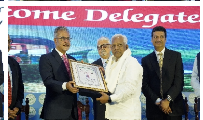
Snapshot of the award presentation ceremony during STAI Annual Convention 2023